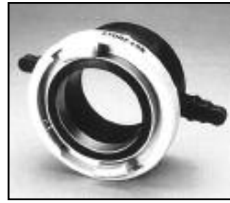
Swivel - Long Handle