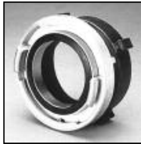
Swivel - Rocker Lug