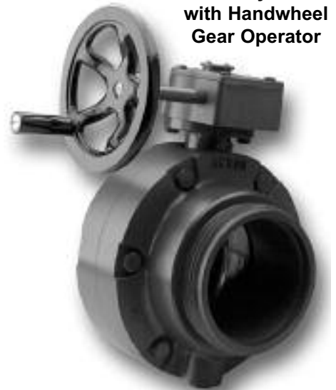
Butterfly Valve with Handwheel Gear Operator

Specify: A - for handwheel gear operator B - for electric actuator and style 9303 controller C - manual throttle handle D - pneumatic operator